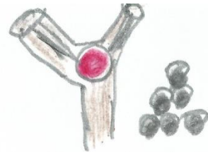
Man the catapults